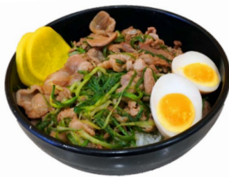
豚丼 BUTA DON

$ 13.75 Deep fried pork with egg sauce & onion over rice