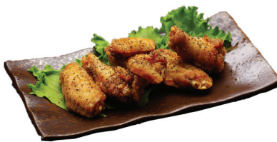
TEBASAKI $ 6.25 Chicken wings