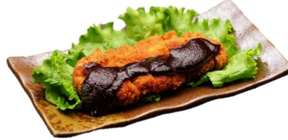
TONKATSU $ 7.95 Fried pork with tonkatsu sauce

KARA AGE Tender fried chicken (Japanese style)