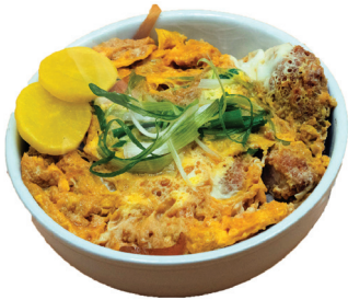
カツ丼 KATSU DON

$ 13.75 Deep fried pork with egg sauce & onion over rice