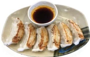
GYOZA (6PC) $ 6.25 Pork dumpling