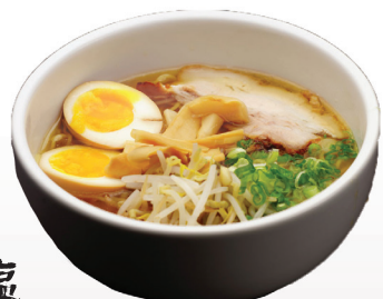
塩 SHIO RAMEN $ 10.75

Egg noodle in a flavorful clear chicken broth with tender braised pork, soft boiled egg, scallions, bean sprouts and bamboo shoots