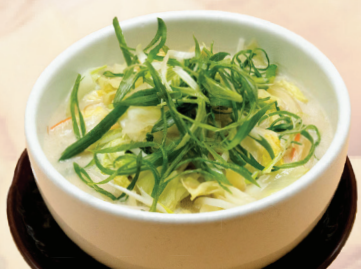
野菜 VEGETARIAN RAMEN $ 11.75

Egg noodle in a pork broth curry soup with fried chicken, soft boiled egg, vegetables and scallions