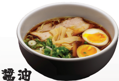
醤油 SHOYU RAMEN $ 10.75

Egg noodle in soy-based chicken broth with tender braised pork, soft boiled egg, scallions, bean sprouts and bamboo shoots