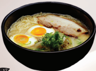
豚骨 TONKOTSU RAMEN $ 11.75

Egg noodle in a flavorful chicken broth with spicy ground pork, garlic, scallions, bean sprouts and green chives