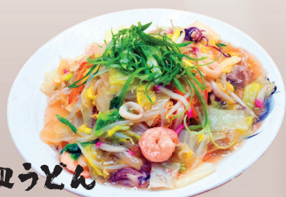
皿うどん SARA UDON $ 11.75

Egg noodle in a flavorful chicken broth with garlic and spicy stir fry vegetables