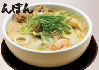
ちゃんぽん CHANPON $ 12.75

Egg noodle in a miso based rich pork broth with tender braised pork, soft boiled egg, scallions, and vegetables