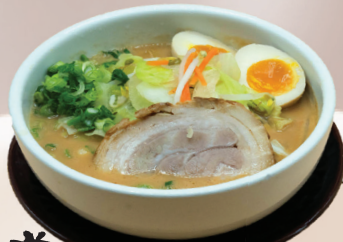
味噌 MISO RAMEN $ 11.75

Egg noodle in a rich pork broth with tender braised pork, soft boiled egg, scallions, and bean sprouts