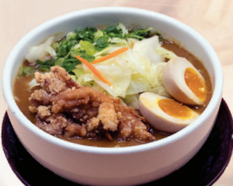
カレー CURRY RAMEN $ 12.75

Egg noodle in a rich pork broth with seafoods, pork, and vegetables